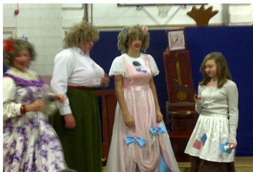
College 3 performing their own version of Cinderella for the Junior School

The Gymnasium is being re-furbished. It provides an excellent space for indoor games and as an auditorium.